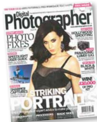
Digital Photographer 30731 #118 $21.95