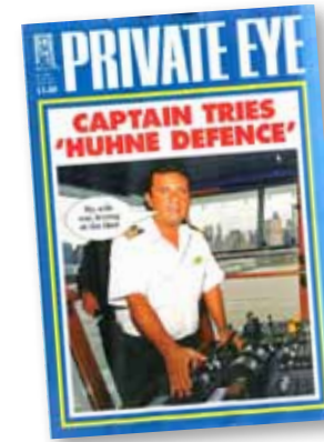
Private Eye 94094 #1306 $8.95