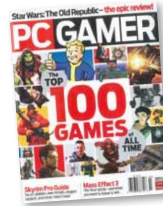
PC Gamer 51383 March 2012 $15.50