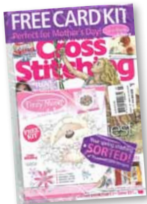
World of Cross Stitching 90063 March 2012 $15.95